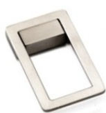
PUXADOR ARTICULADO VERTICAL