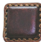
PUXADOR QUAD.40MM IMIT. PELE CAST.