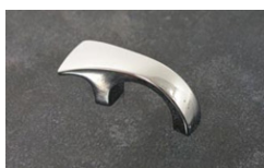
PUXADOR PORCA DE MURÇA