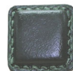
PUXADOR QUAD.40MM IMIT. PELE VERDE