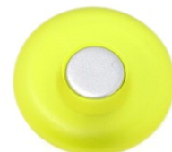
PUXADOR ARCO-IRIS REDONDO