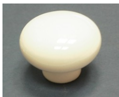
PUXADOR PORCELANA LISO ORIENTAL BR.