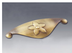
PUXADOR CONCHA NAVIDAD