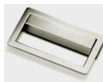
PUXADOR ARTICULADO HORIZONTAL